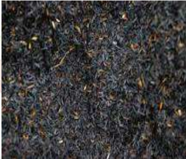
Plate 2. Sample of RHA

with the availability of water to make cementitious composites. The specific surface area and fineness of RHA (Figure 2) influence its reactivity and stabilization potential (Gautam, Batra and Singh, 2019; Givi, A. N., Abdul Rashid, S., Abdul Aziz, F. N. & Mohd Salleh, 2010).