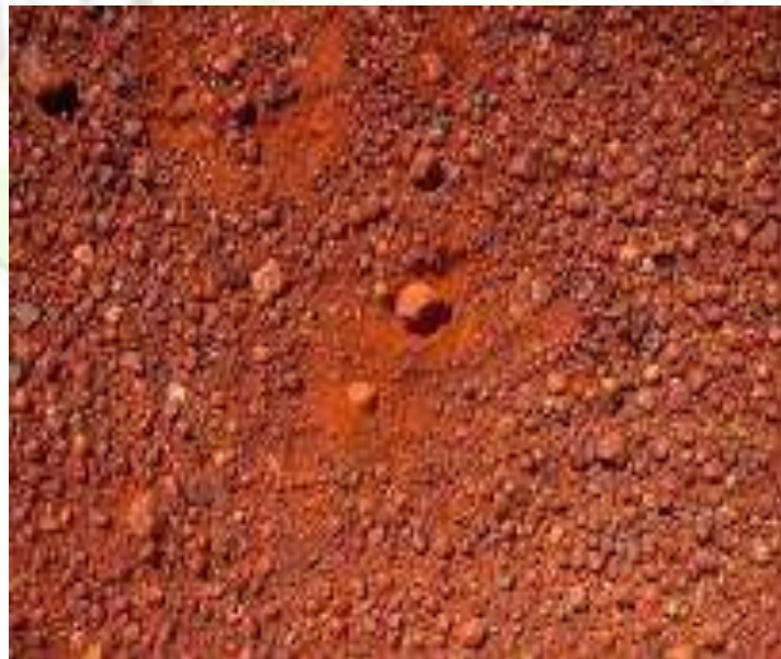
Plate 1. Sample of Lateritic soil

Lateritic soils (Figure 1) are formed in hot and humid climatic conditions through the intense weathering of parent rocks (Ola, 1982). They are rich in iron and aluminum oxides and generally exhibit high plasticity, low strength, and poor workability (Ola, 1982). These properties necessitate stabilization techniques to enhance their performance in engineering applications (Ola, 1982). Typical geotechnical characteristics include high natural moisture content, high plasticity index, and low CBR values (Ola, 1982).